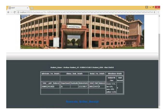
Fig.5.2 Generate NO DUE status

When students enter the classroom, the RFID-reader automatically reads their RFID-cards, where system will compare their information with information stored on the DBMS according to their ID's that we have assigned to them. Eventually, the professor will submit all the