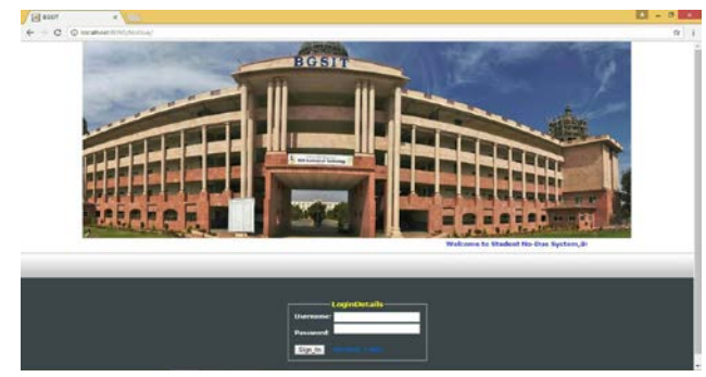
Fig.5.1 Login module For the System

When the professor arrives in class, he/she logs in and submits a password on the PC to our system, after which our system opens his/her page as shown in below figure.