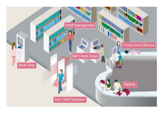
Fig. 4.2 Architecture of Library Management System

-As shown in the figure for library management, RFID card will be used for entry and exit checking in from library, for book checking (availability) purpose and for book withdrawal and return purpose.