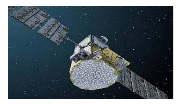
Fig 1.3 Array Antenna in satellite

In order to decrease risk and cost, a modular approach to building the array, comprising highly integrated tiles (incorporating RF radiating elements, feed networks and amplifiers, as well as power and control signal distribution and also structural and thermal management functions), is a promising strategy that greatly advances the feasibility of GEO based active DRAs. Advances in enabling technologies, which may include semiconductor technologies leading to higher RF power levels and higher DC-to-RF power conversion efficiencies, alternative beam forming technologies such as optical beam forming, cheaper and highly integrated electronics, low-loss phase shifting technologies such as those using Micro Electro Mechanical Systems (MEMS) or others, and so on, will make active DRA solutions increasingly more attractive in the future.