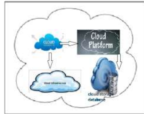
Figure 2: Architecture of Cloud

Cloud design is consisting of multiple resources operating for cloud altogether with one another having loose coupling between them so the system won't have direct dependencies and any of the half will be additional, updated or modified just in case of requirement/failure while not moving the remainder of the system. It involves each hardware and software package applications in [1,2,3].