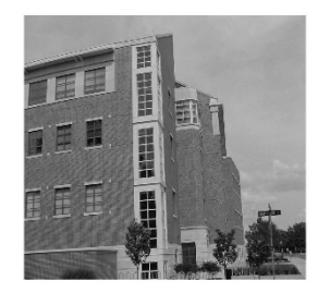
Figure 2: 2(a) Original image