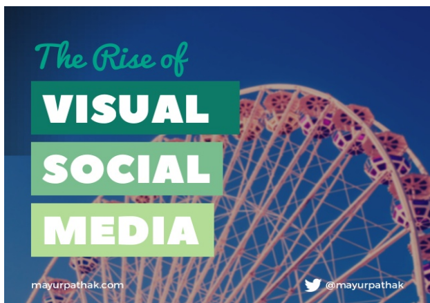
Figure 1; The Rise of visuals in social media