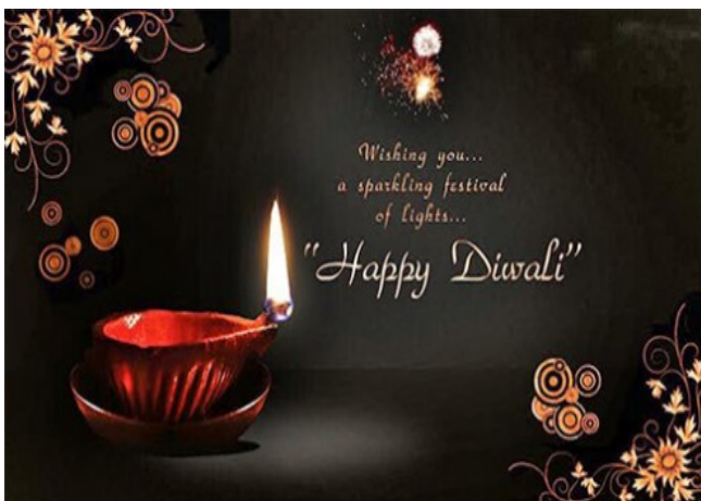
Figure 6: A Diwali Greetings through social media

Marketing has been around for a lot more time than we may be tempted to believe. Social media is relatively new when compared with it but there is no way to deny the fact that it is the one medium that had the highest influence ever on marketing. When communicating with the target audience, gaining access to a two-way communication is really important. Social networks like Face book and