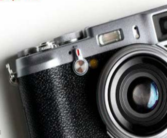
Figure 3: A Picture Really Does Paint 1000 Words.

Social media has also changed the way that we interact, mainly the way we have lost some of our social skills. Some people are completely incapable of carrying on a normal conversation or interacting with people in person because of the dependency of social media. Social networks are becoming one of the dominant ways we communicate. People are more obsessed with checking their smart phone every 2 minutes than engaging in meaningful conversation with their child or spouse. Social media and technology are double-edged swords. It's awesome to have and can really help us, but it also distracts us to the point of being blind and deaf to everything else going on.