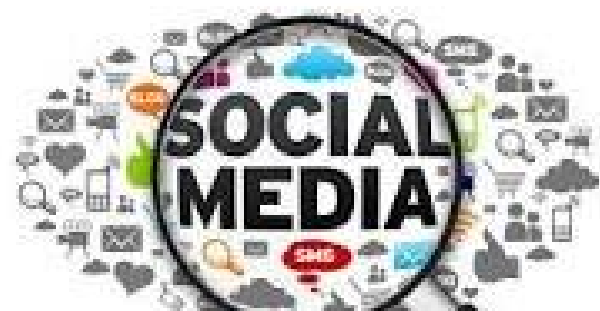
Figure 7: Positive effects of social media

The increasing popularity of social sites like Twitter, Face book and LinkedIn, social networks has gained attention as the most viable communication choice for the bloggers, article writers and content creators. These social networking sites have opened the opportunity for all the writers and bloggers to connect with their tech savvy clients to share your expertise and articles. Your audience will further share your articles, blog or expertise in their social circle which further enhance your networks of the followers.