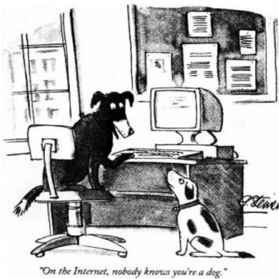
Figure 5: On anonymity of internet usage!

As more and more Social media interaction now dominates both online and offline conversations (Example: A Diwali Greetings – Figure 6). In a society where interacting and over-sharing online is the norm, you're probably more likely to speak to friends and family through electronic devices than face-to-face. But are social media and modern technology destroying our interpersonal social skills? Generations are born into the social age; social media will continue to be the favored communication form among young people. However, this shift may begin to affect their ability to properly communicate in person with peers.